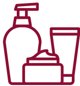
Personal Care & Cosmetics